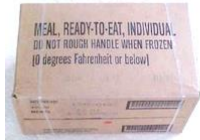
Shown is a case of government contract MRE’s.

Availability – After the first Persian Gulf War of 1991, a vast amount of military goods arrived on the civilian markets, some with legitimate backstories and some with shady backstories. Among these items was the highly coveted MRE. I could easily locate dozens of cases with 12 individual meals to a box. Cost per box ranged between $30.00 to $20.00. I often had two dozen cases of MREs stacked up in my room, my attic and under my bed. Soon I became known as that crazy survivalist kid. I was also known as the person who could get you the goods . Teachers and many others enjoyed shopping at my house because they couldn’t find what I had already located. Not bad for a teenage kid running his own black market surplus ring out of his parent’s garage.