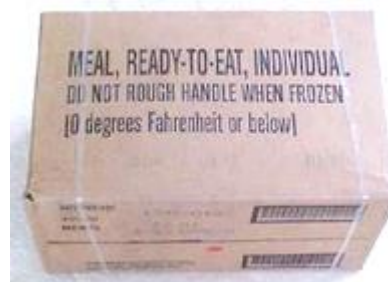
Shown is a case of government contract MRE’s.

Availability – After the first Persian Gulf War of 1991, a vast amount of military goods arrived on the civilian markets, some with legitimate backstories and some with shady backstories. Among these items was the highly coveted MRE. I could easily locate dozens of cases with 12 individual meals to a box. Cost per box ranged between $30.00 to $20.00. I often had two dozen cases of MREs stacked up in my room, my attic and under my bed. Soon I became known as that crazy survivalist kid. I was also known as the person who could get you the goods . Teachers and many others enjoyed shopping at my house because they couldn’t find what I had already located. Not bad for a teenage kid running his own black market surplus ring out of his parent’s garage.